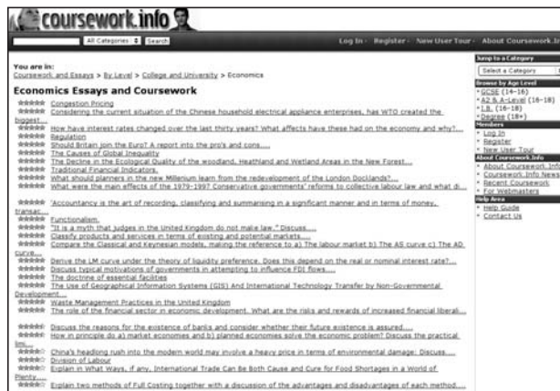
Figure 4. Essays on offer from Coursework.info

A downside of the ease of access provided by the Web is the great ease with which students can plagiarise existing material. Feeding this temptation are a spate of so-called 'research assistance' essay banks. Students donate or sell their essays to a bank, along with feedback they were given by their tutors. Other students can then browse through these to find an essay similar to what they are working on and pay a small fee to download it. Each site may have several hundred essays specifically on economics, although many are of such poor quality that students have little to gain by submitting them. Figure 4 shows some of the economics content offered by Coursework.info, which invites users to 'invest in [their] education' by paying to download the essays. Similar sites are listed by the JISC Plagiarism Advisory Service ( http://www.jiscpas.ac.uk/site/res_essay.asp ).